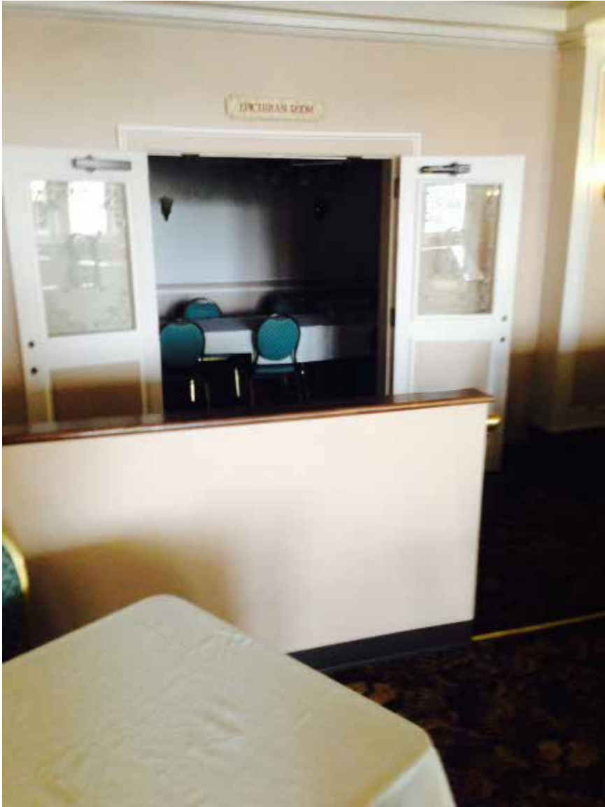
RESTAURANT PRIVATE ROOM