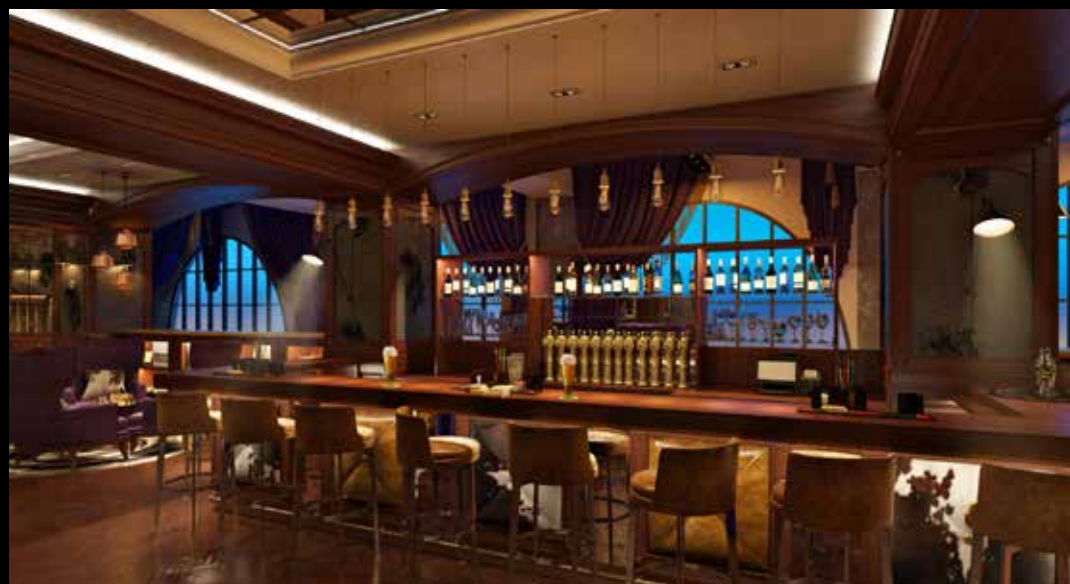
CLUB NORTHLAND HOTEL NORTHLAND | Green Bay, Wisconsin