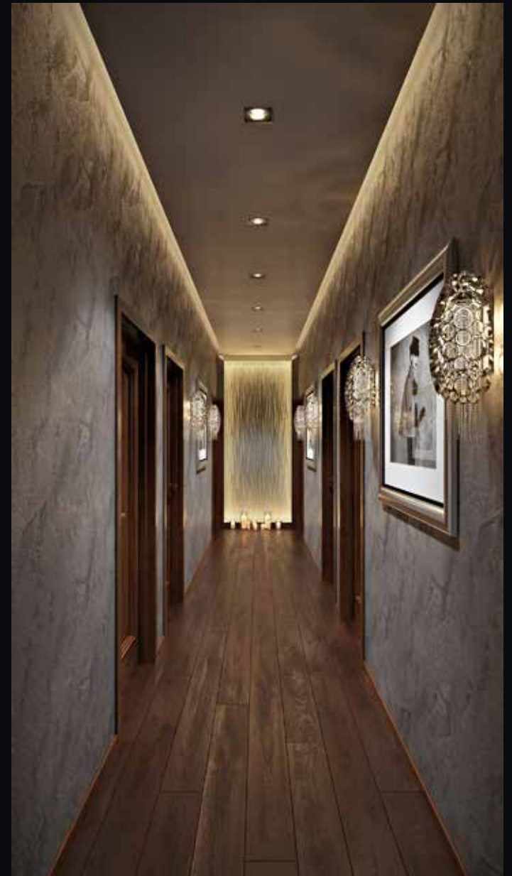
NORTHLAND SPA HOTEL NORTHLAND | Green Bay, Wisconsin