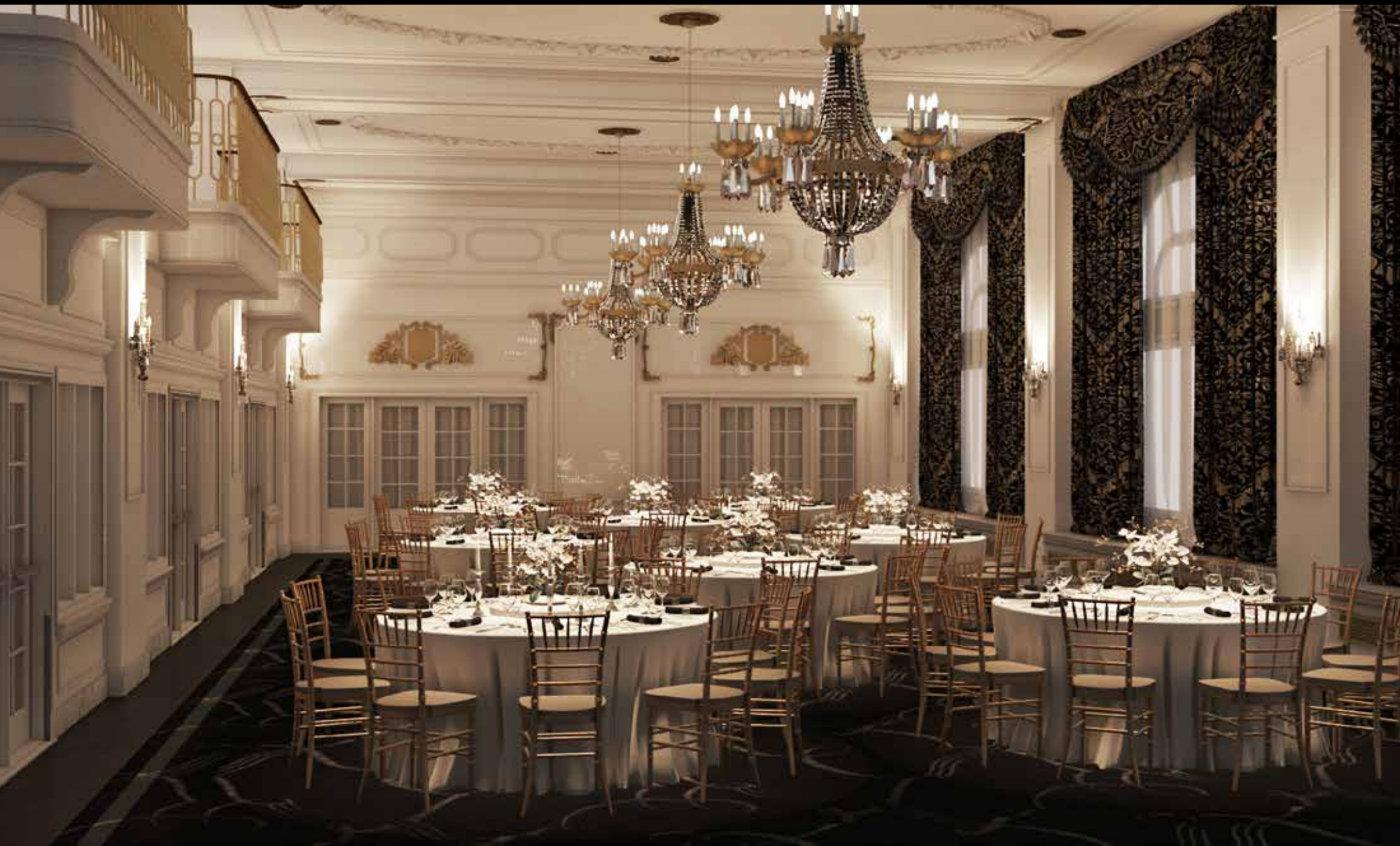
CRYSTAL BALLROOM HOTEL NORTHLAND | Green Bay, Wisconsin