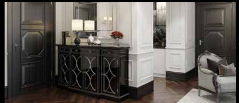
LAMBEAU SUITE HOTEL NORTHLAND | Green Bay, Wisconsin