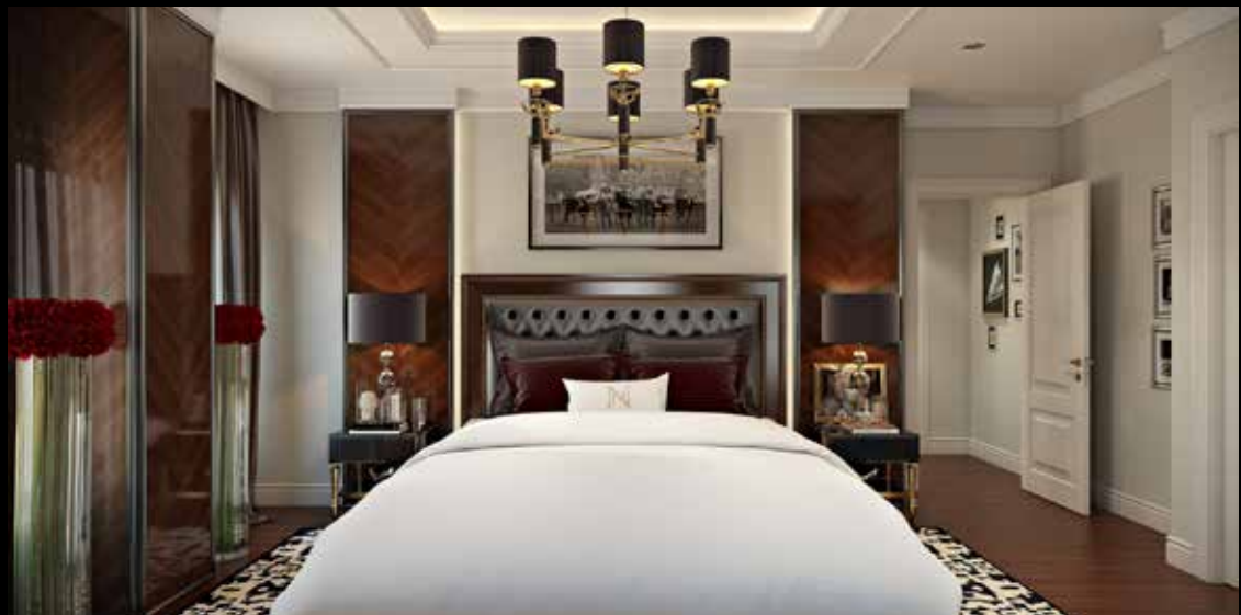
LOMBARDI SUITE HOTEL NORTHLAND | Green Bay, Wisconsin